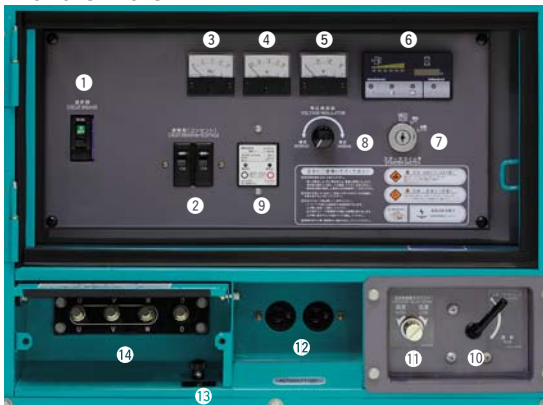
TLG-13ESY • 18ESY