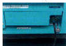
Remote Control Unit